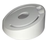
Inclined ceiling mount