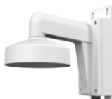
Wall mount + junction box